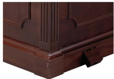
High Executive electrical height adjustment, with 2 pedestals, THXEW5134