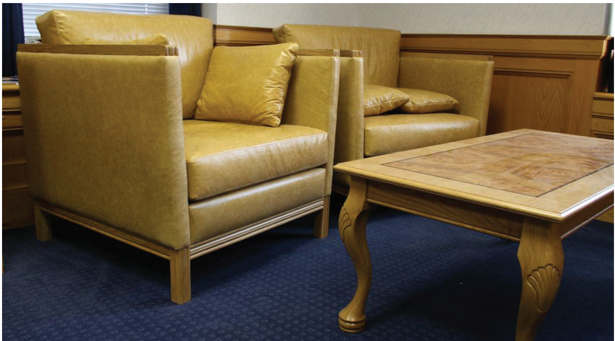
Hampshire style 3-seater sofa and armchairs HEXCT534_SP in Queen Anne Style