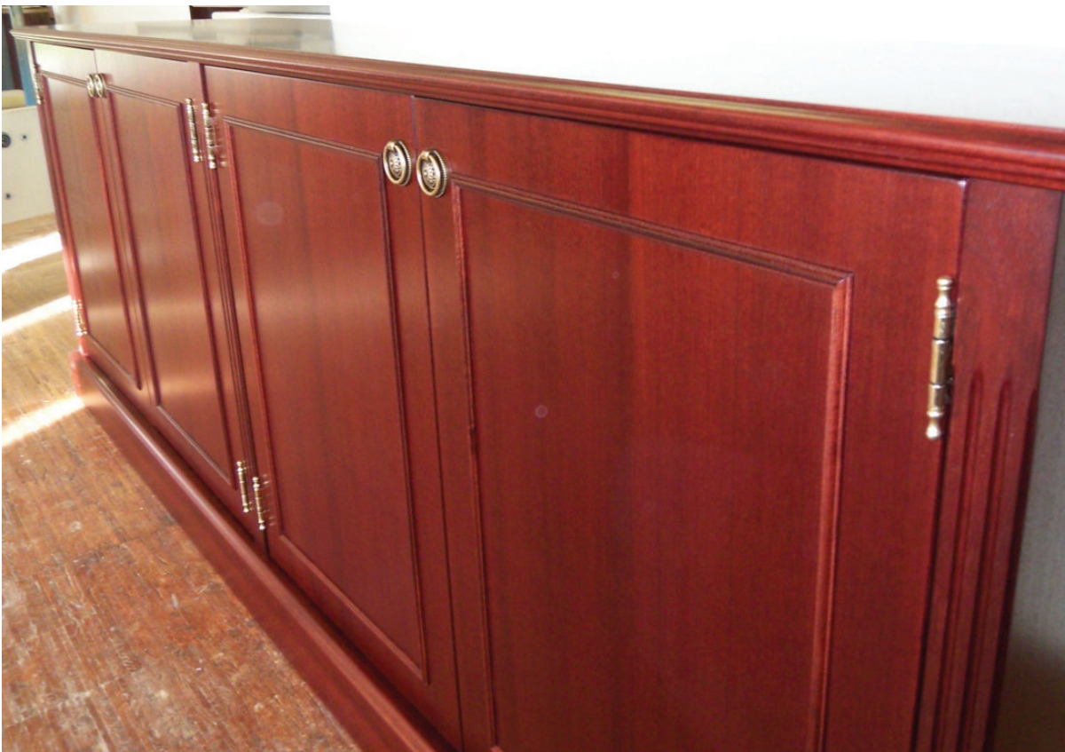
Executive Sideboard, EXCA663