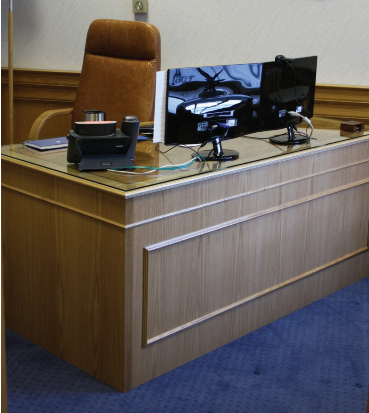
Executive Workdesk EXWS124 w/glass top In natural oak with burr inlay and cross bending Swivel chair Consul style