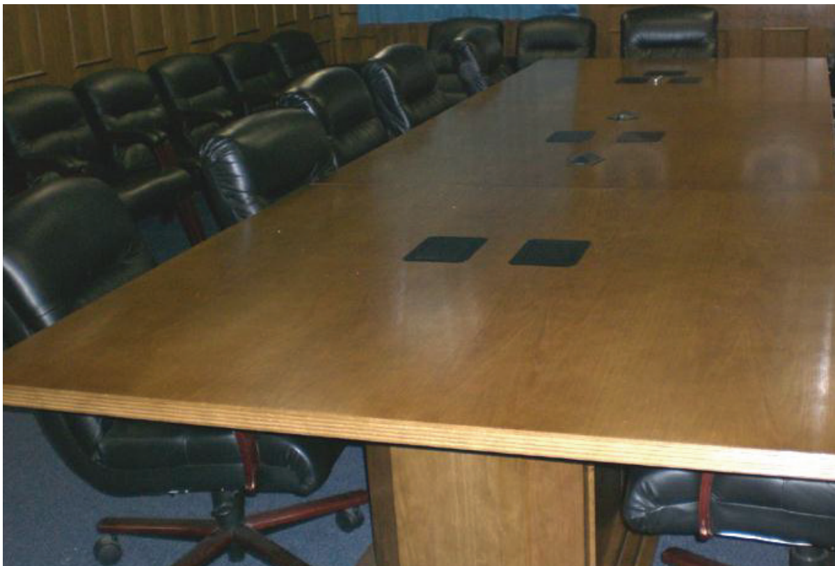
High Executive custom made conference room Confence desk HEXCT519 w/ cable management Wallpanels with monitors and full technical equipment for video conferences Sirius style swivel chairs