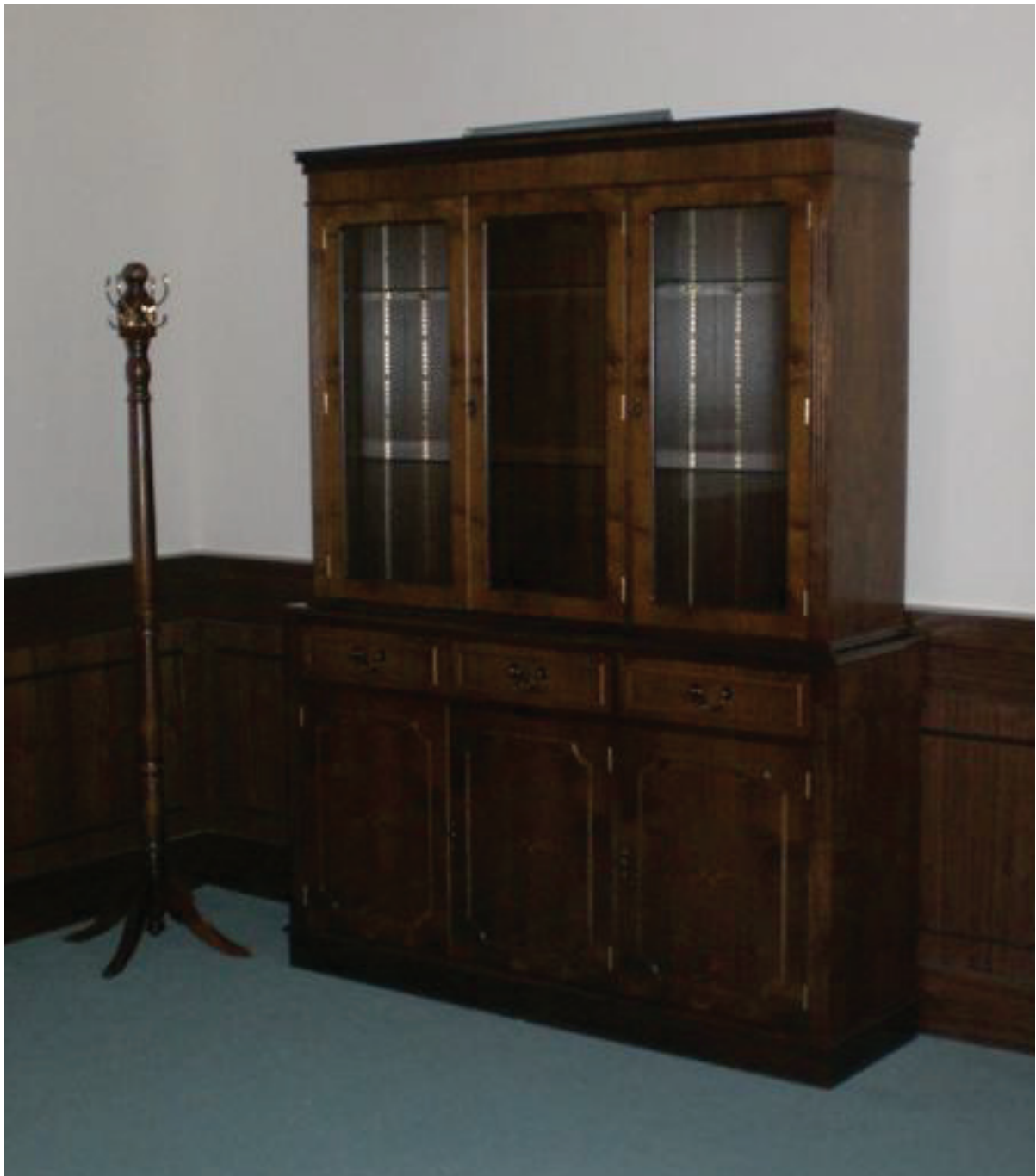
Executive cabinet combination