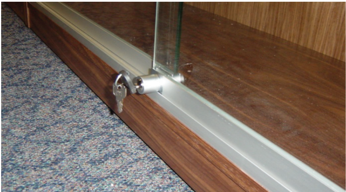
Custom made Trophycase with illumination, sliding doors