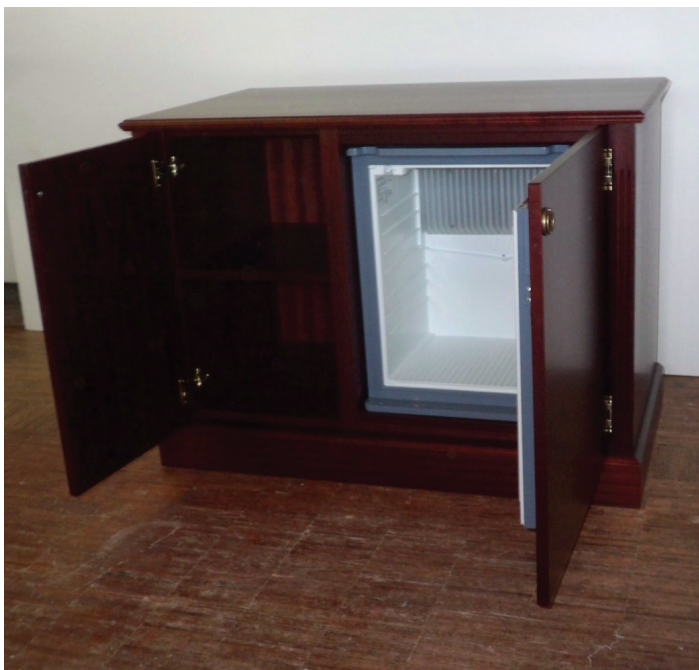
Executive Sideboard, EXCA616_sp with build in fridge without frames, with one complete top