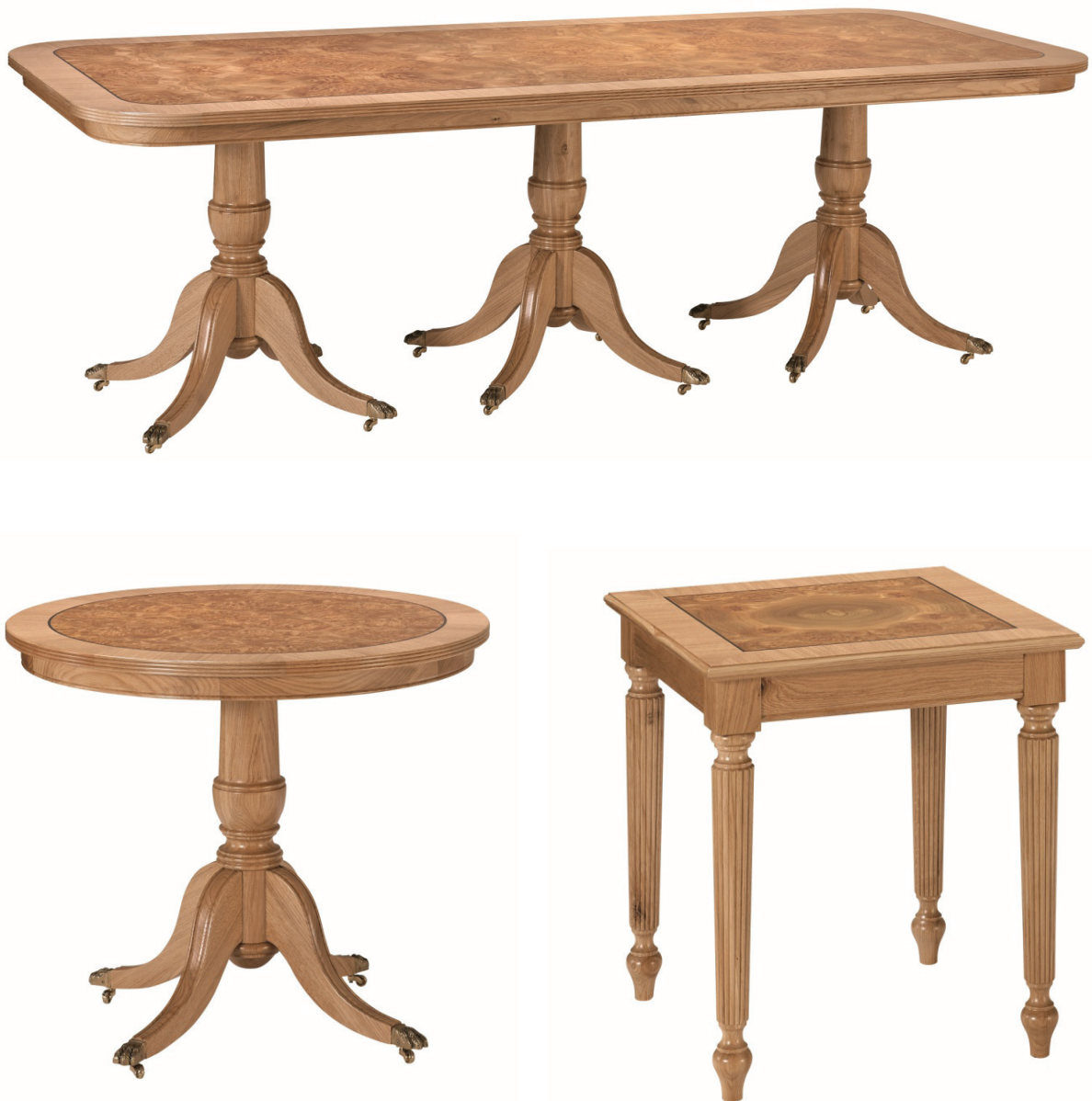
Above: High Executive conference table, HEXCT514-TPC-Base Left: High Executive conference table, HEXCT525-TPC-Base Right: High Executive conference table, HEXCT351_sp, Victorian style