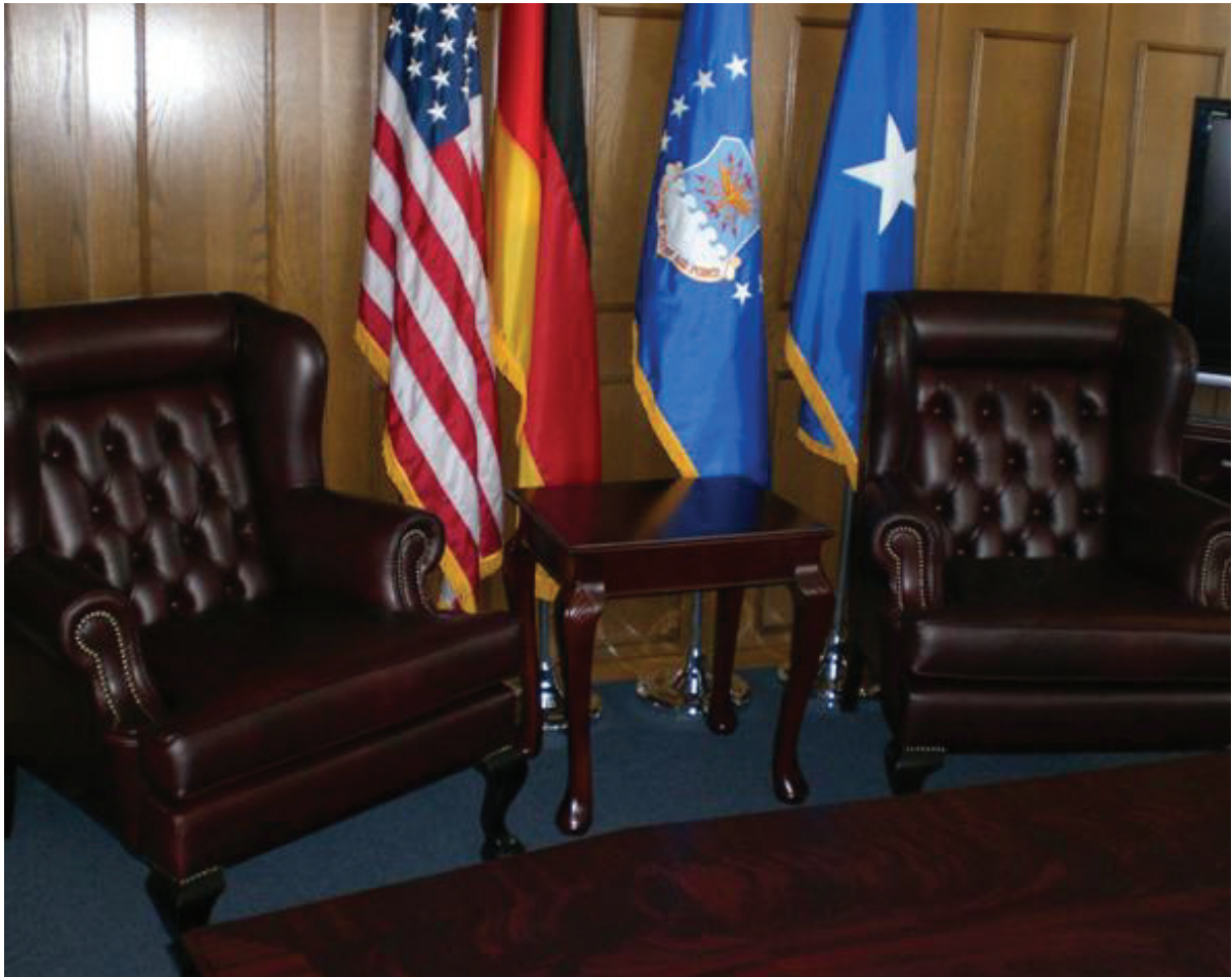
Armchairs: Chairmans sytle End table: HEXCT541_sp Queen Anne style Wall panels: custom made