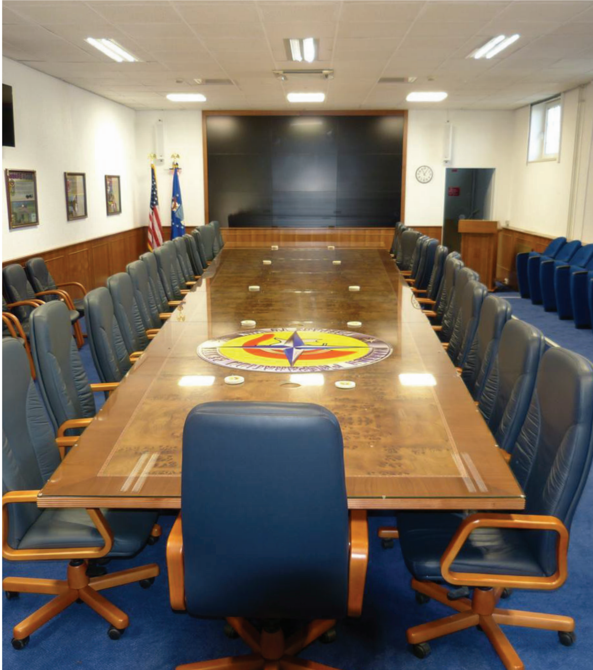
High Executive custom made conference room Rectangular confence desk w/ cable management, top with cross bending Wallpanels with monitors and full technical equipment for video conferences Sirius style presidential swivel chairs. Sidechairs: left: Sirius Sled Base / right: tip up chairs (cinema seating)