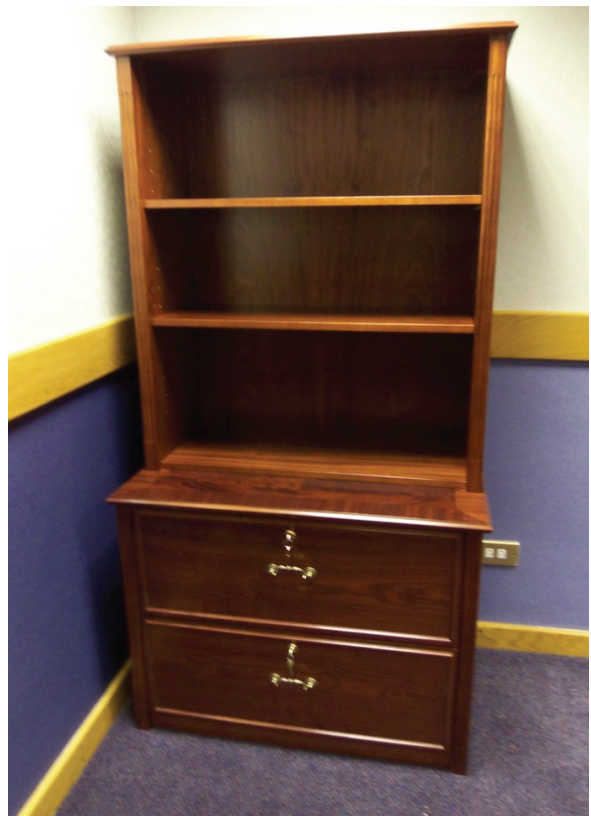
Executiver Sideboard, 2xHEXCA682 with one complete top Executive hangingfile cabinet EXHF842 EXHF 831 & EXES1112