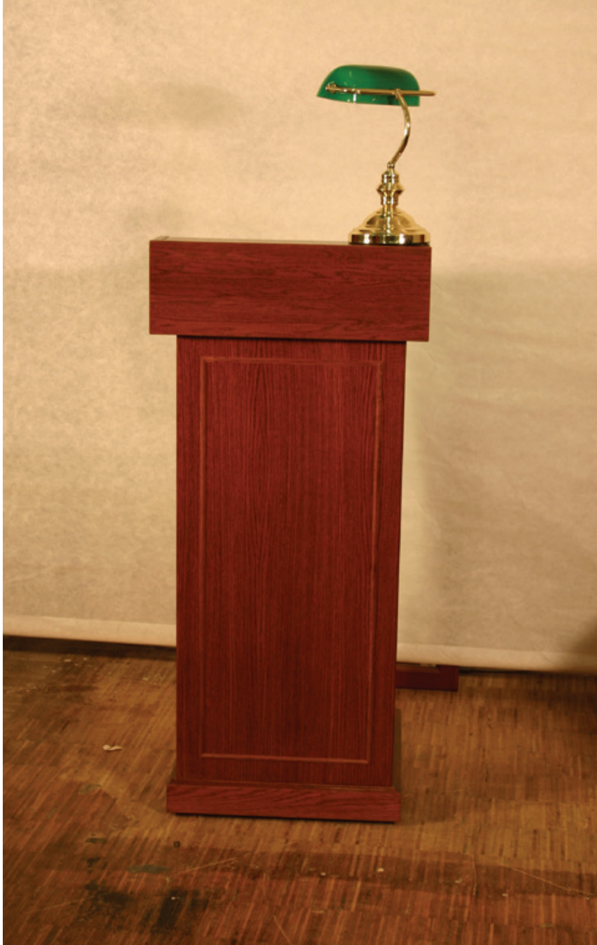
Executive lectern, EXLT1614