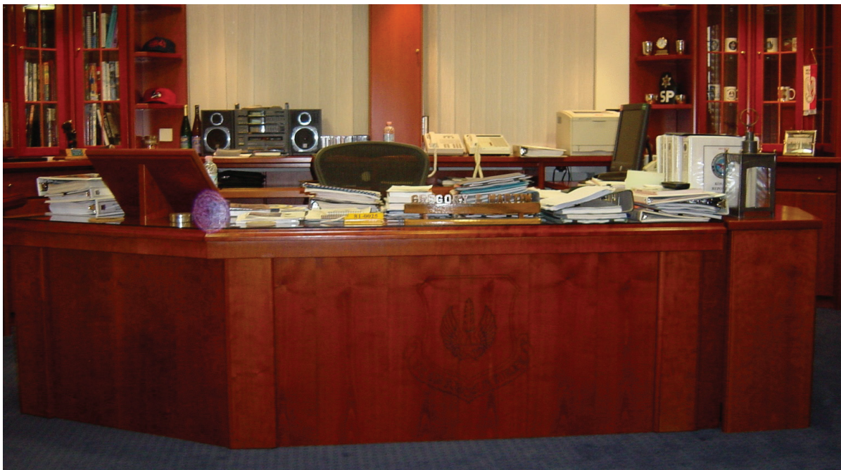
High Executive office with bow shape desk Custom made executive workstation