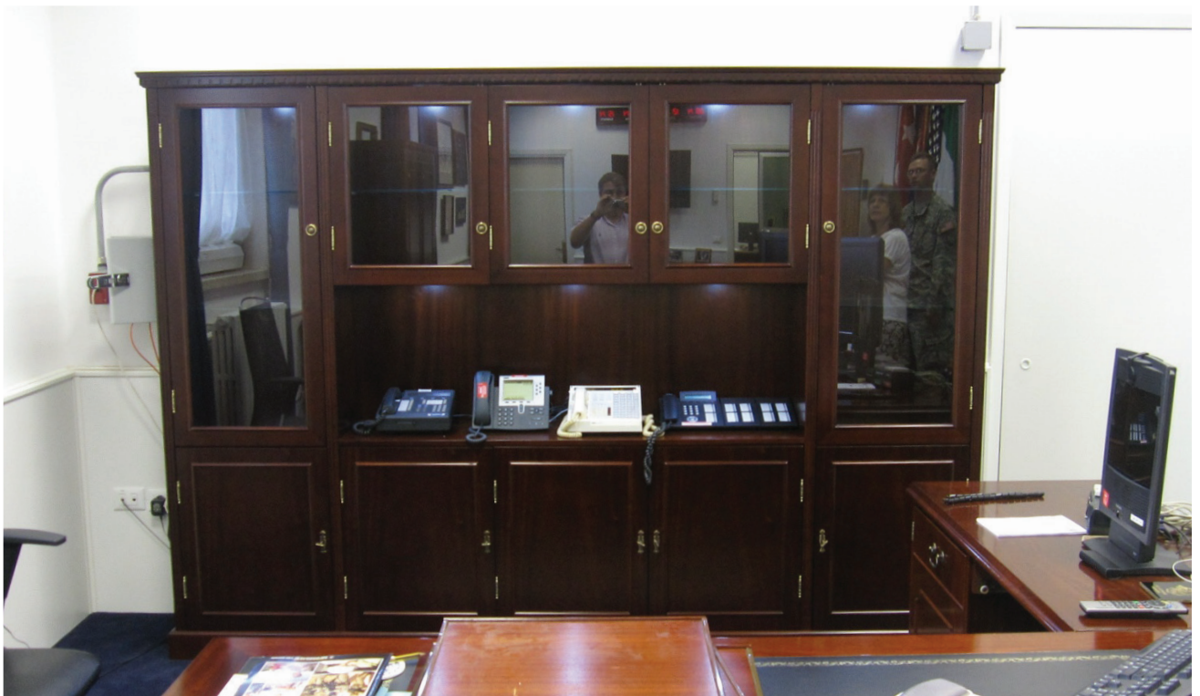
Executive cabinet combination, custom made