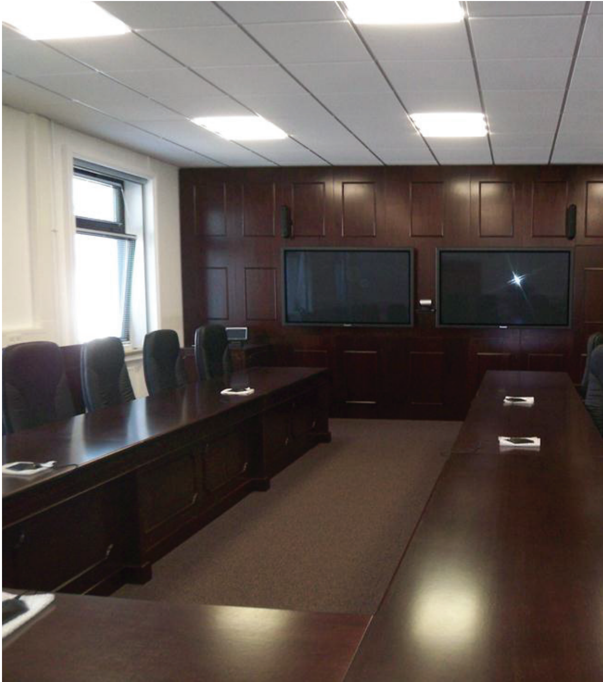
High Executive custom made conference room U-shaped confence desk w/ cable management Wallpanels with monitors and full technical equipment for video conferences Sirius style presidential swivel chairs