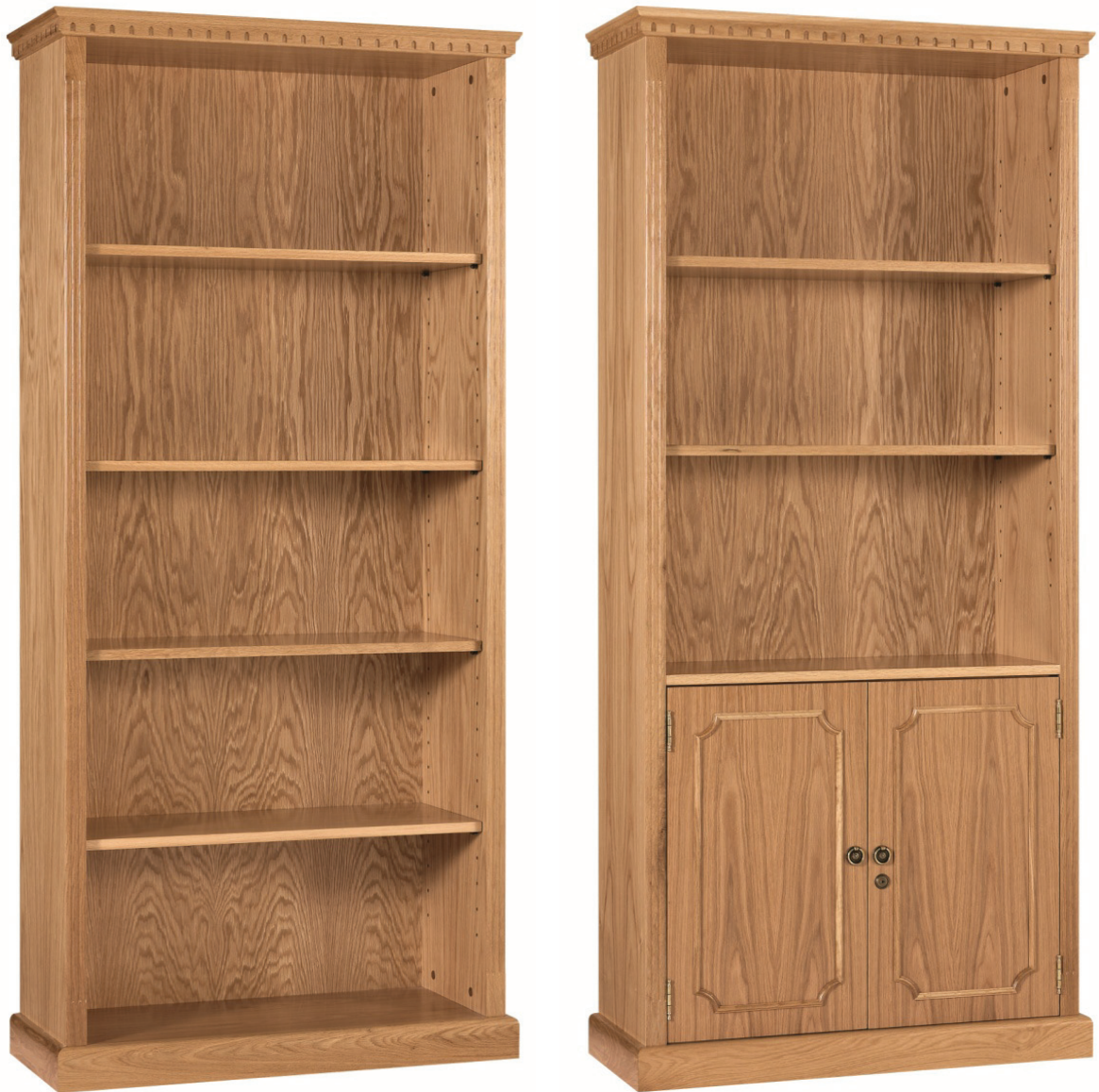
High Executive Cabinets HEXCA661, HEXBC943