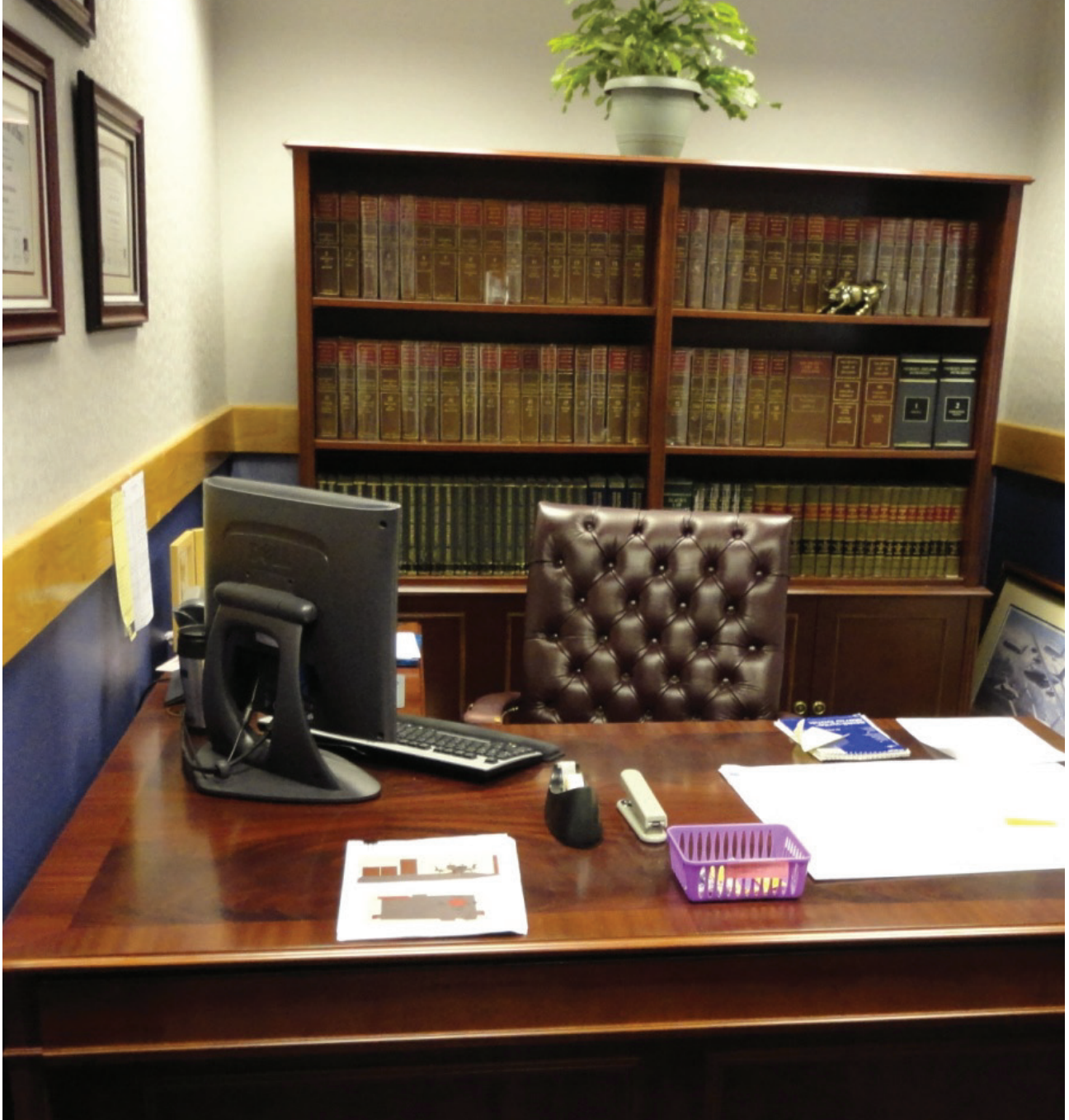
executive office with L- shape desk and cabinet combinations EXWS138, EXCA664, EXES1112_double