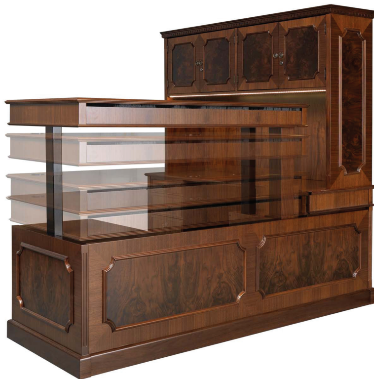
High Executive Sit-Stand Desk with fix height return