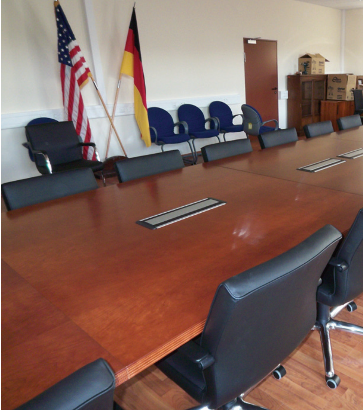
Modern classic custom made conference table