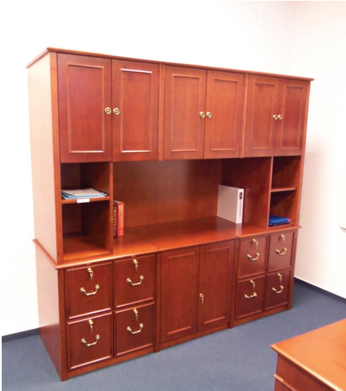
Executive cabinet combinations, EXHF821_sp, EXCA 312, EXHF821_sp, On top unit EXOH251_sp