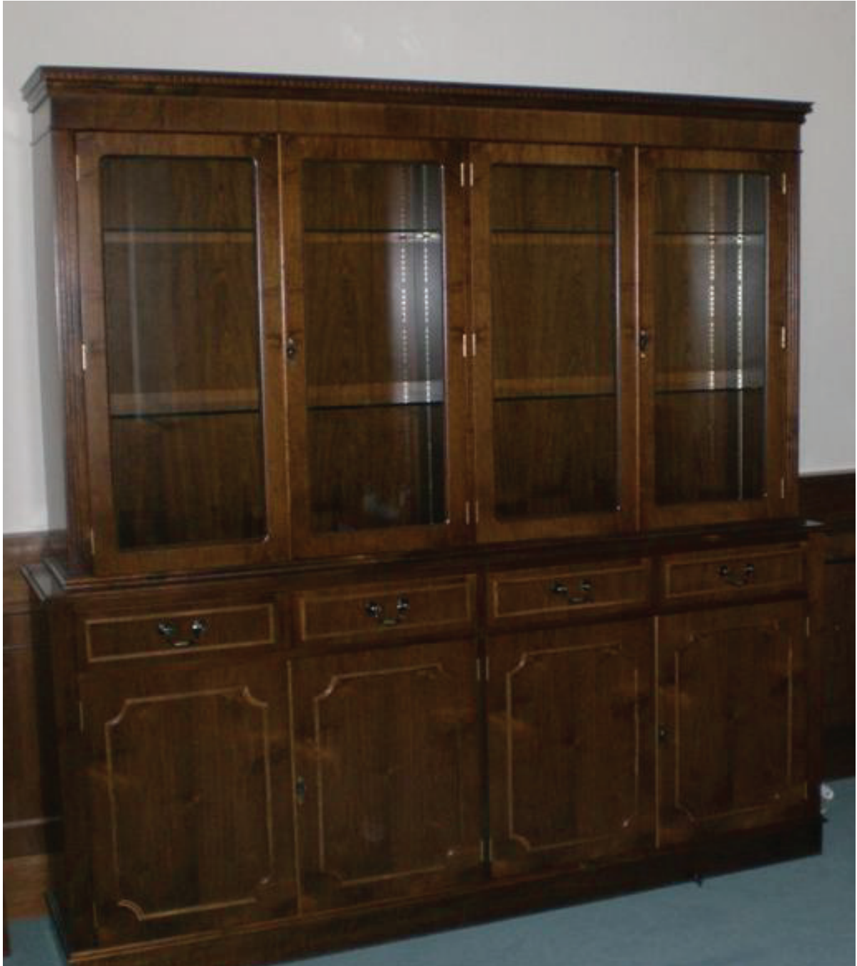
Executive cabinet combination