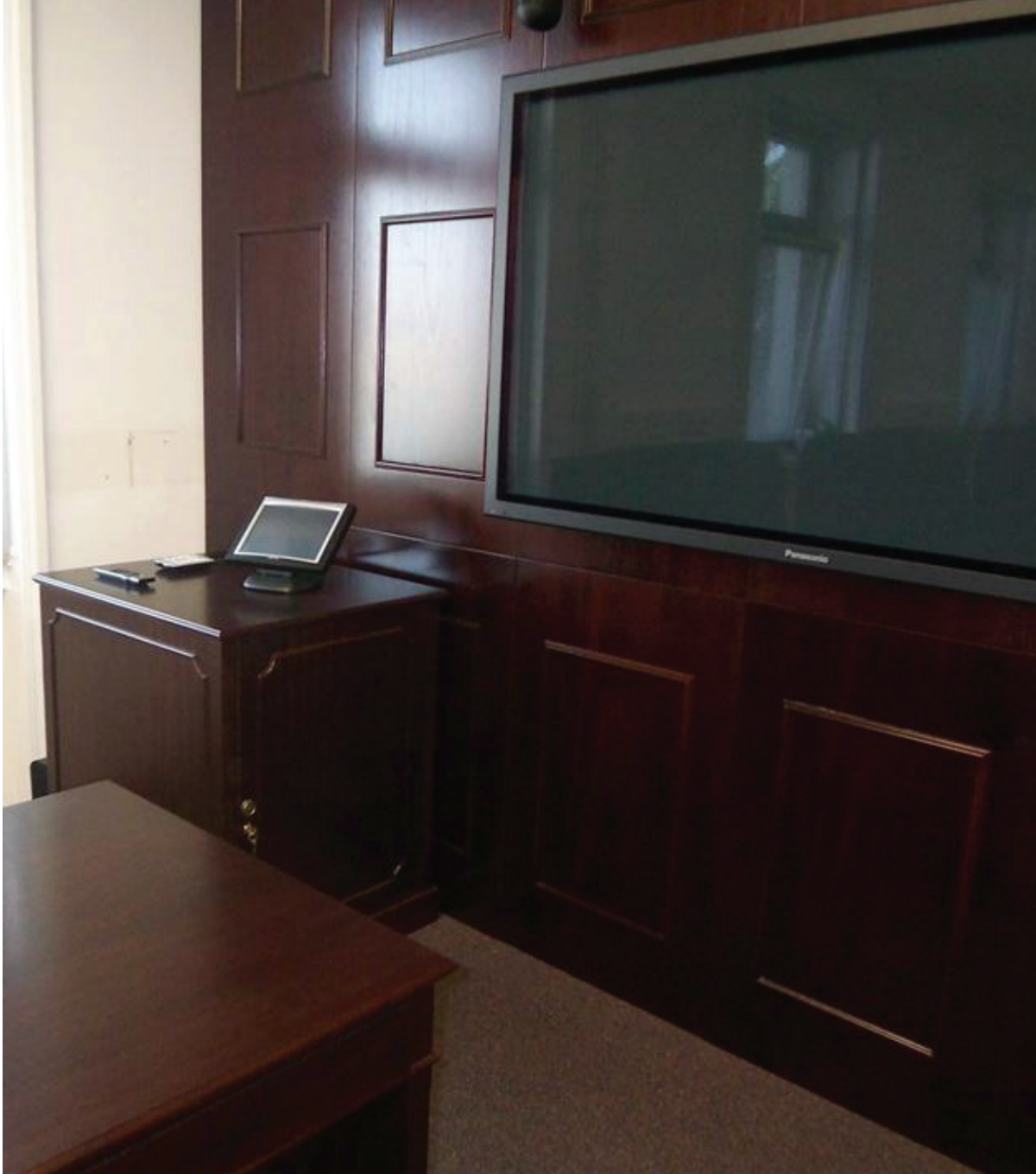
High Executive custom made conference room