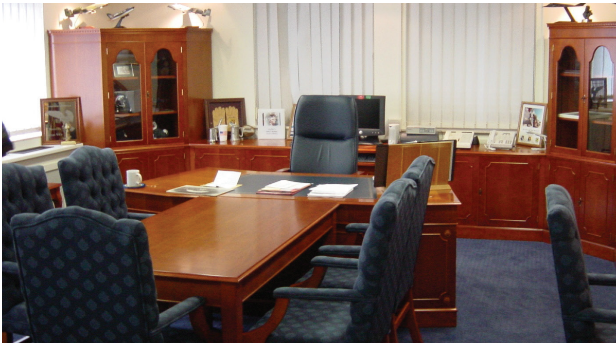
Custom made executive conference table High Executive Office with bow shape desk