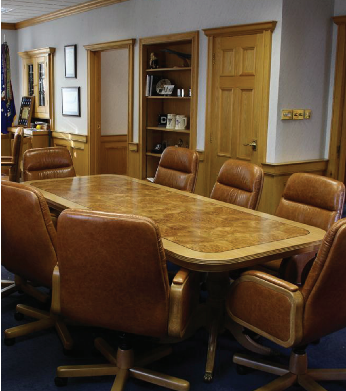
High Executive Conference Desk, HEXCT514-TPC-Base w/glass top and Chairs, Viceroy style swivel armchair In natural oak with burr inlay and cross bending