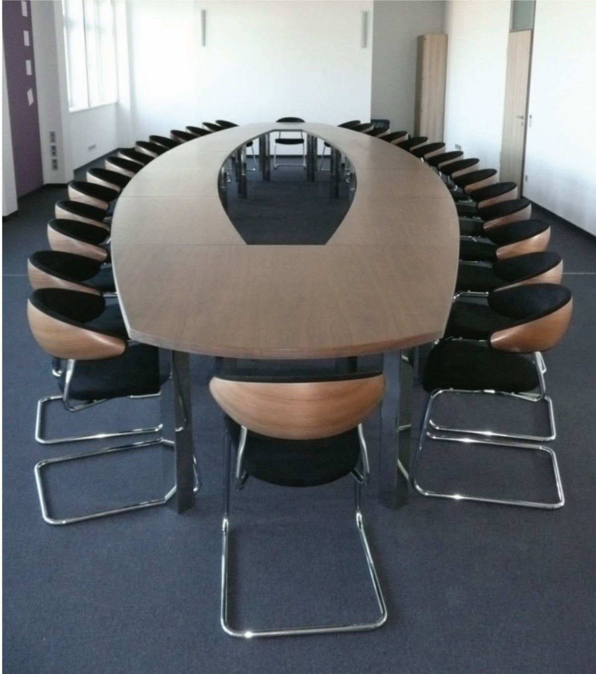
Modern custom made conference table Martin Stoll chairs