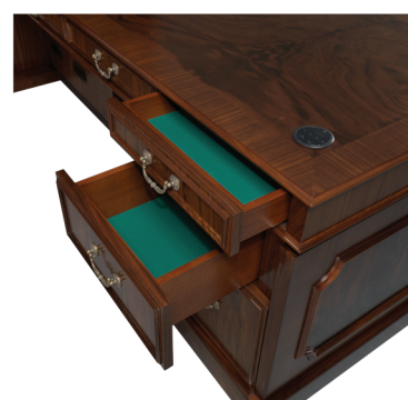
High Executive Sit-Stand Desk with fix height return: THXEW122 Main Desk electrical height adjustable from 75 to 130 cm with 2 pedestals, THXWR123 Return Desk fix height 76 cm Color: Walnut with Burr Inlays and crossbanding Size: 210 x 90 cm / 180 x 60 cm