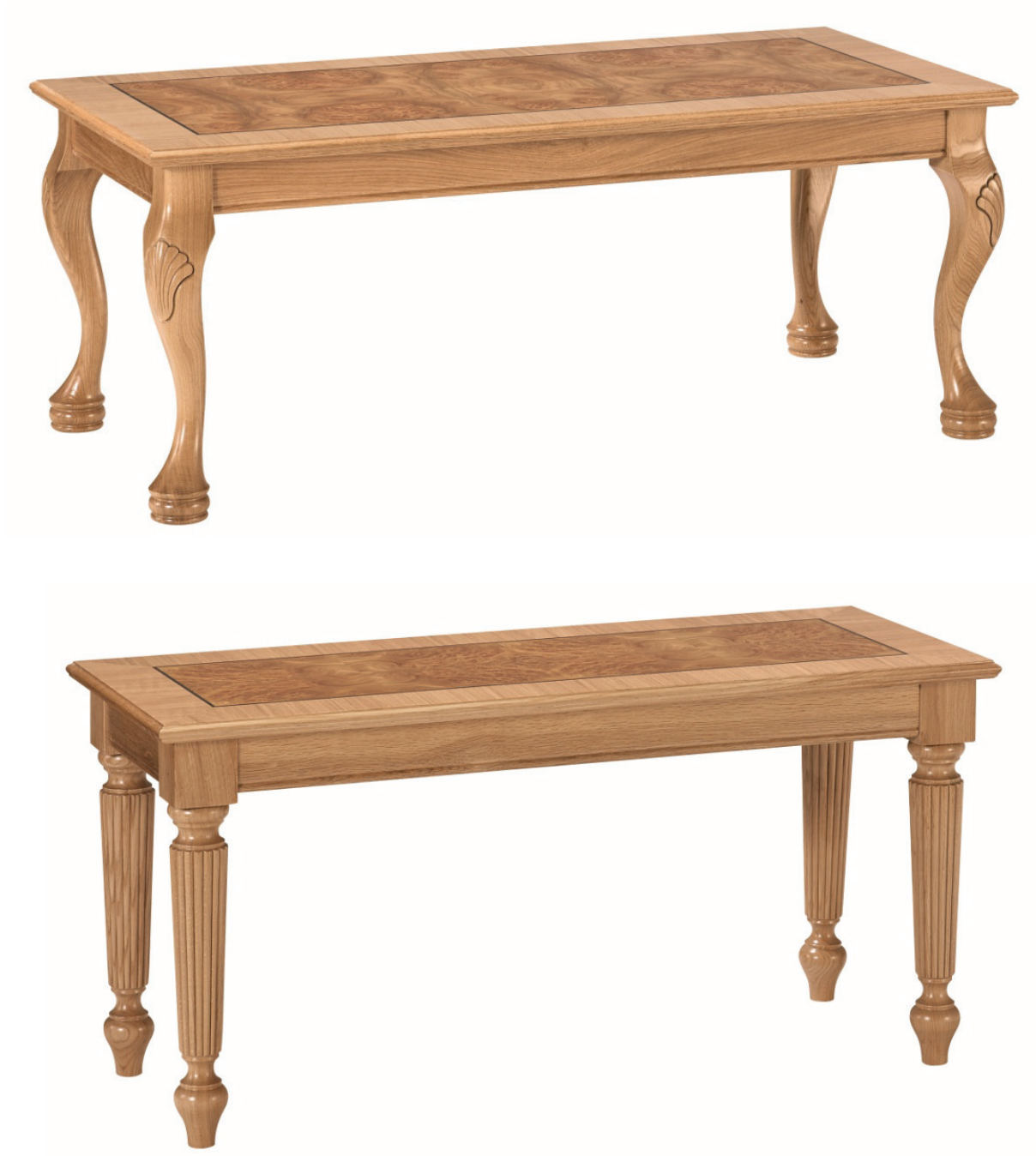
Above: High Executive coffee table, HEXCT534_sp, Queen Anne Style Below: High Executive coffee table, HEXCT533_sp, Victorian style