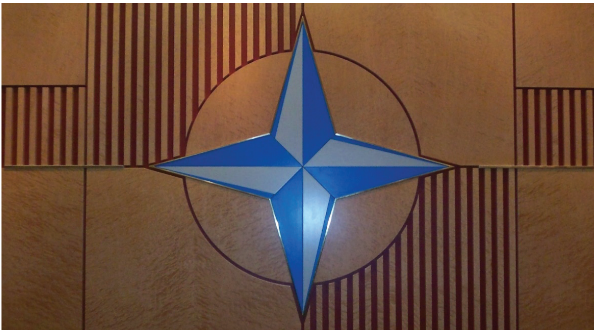
Above: Custom made award boards Below: Custom made wall paneling