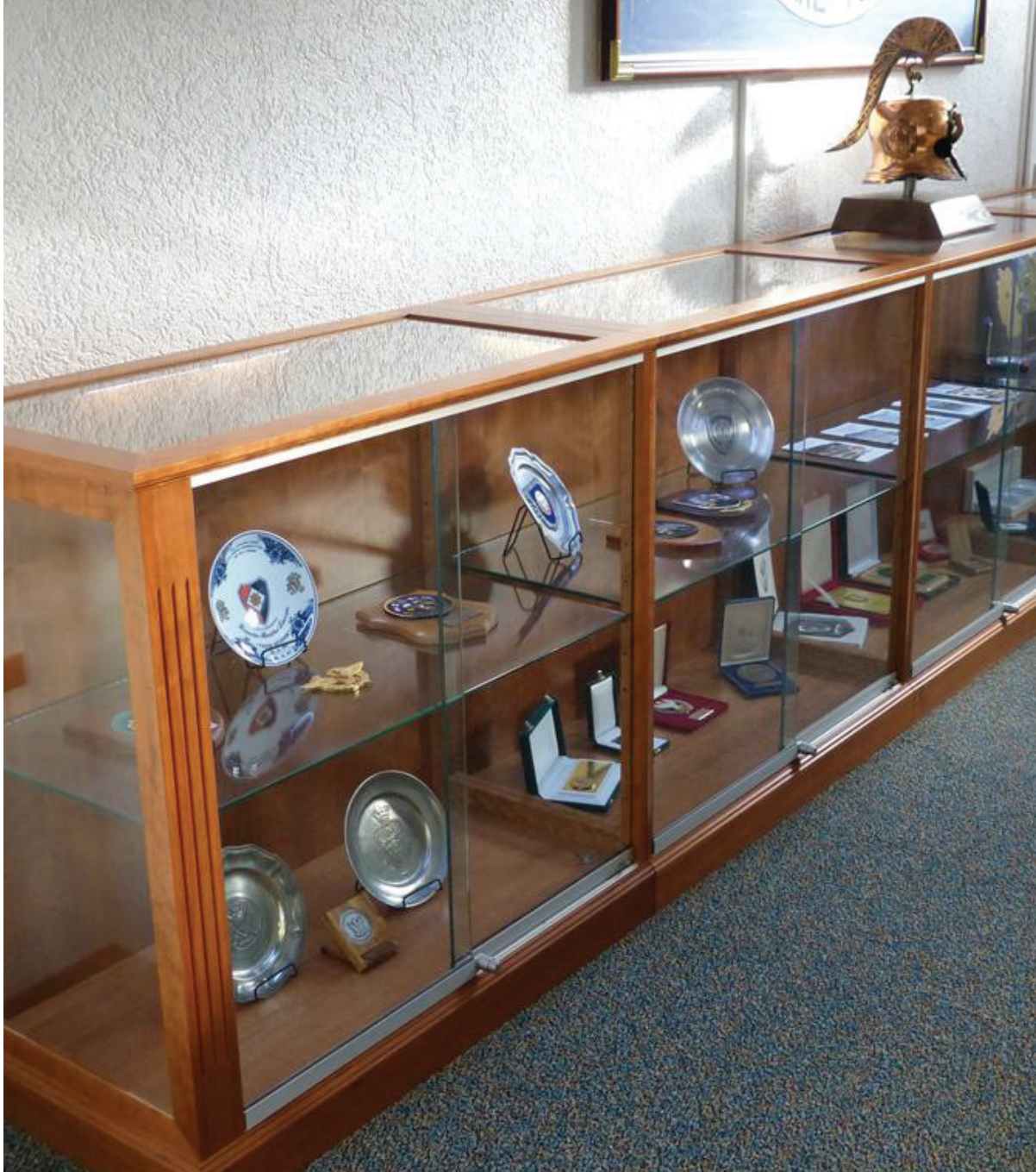
Executive custom made Trophycase with sliding doors Illumination with LED technology