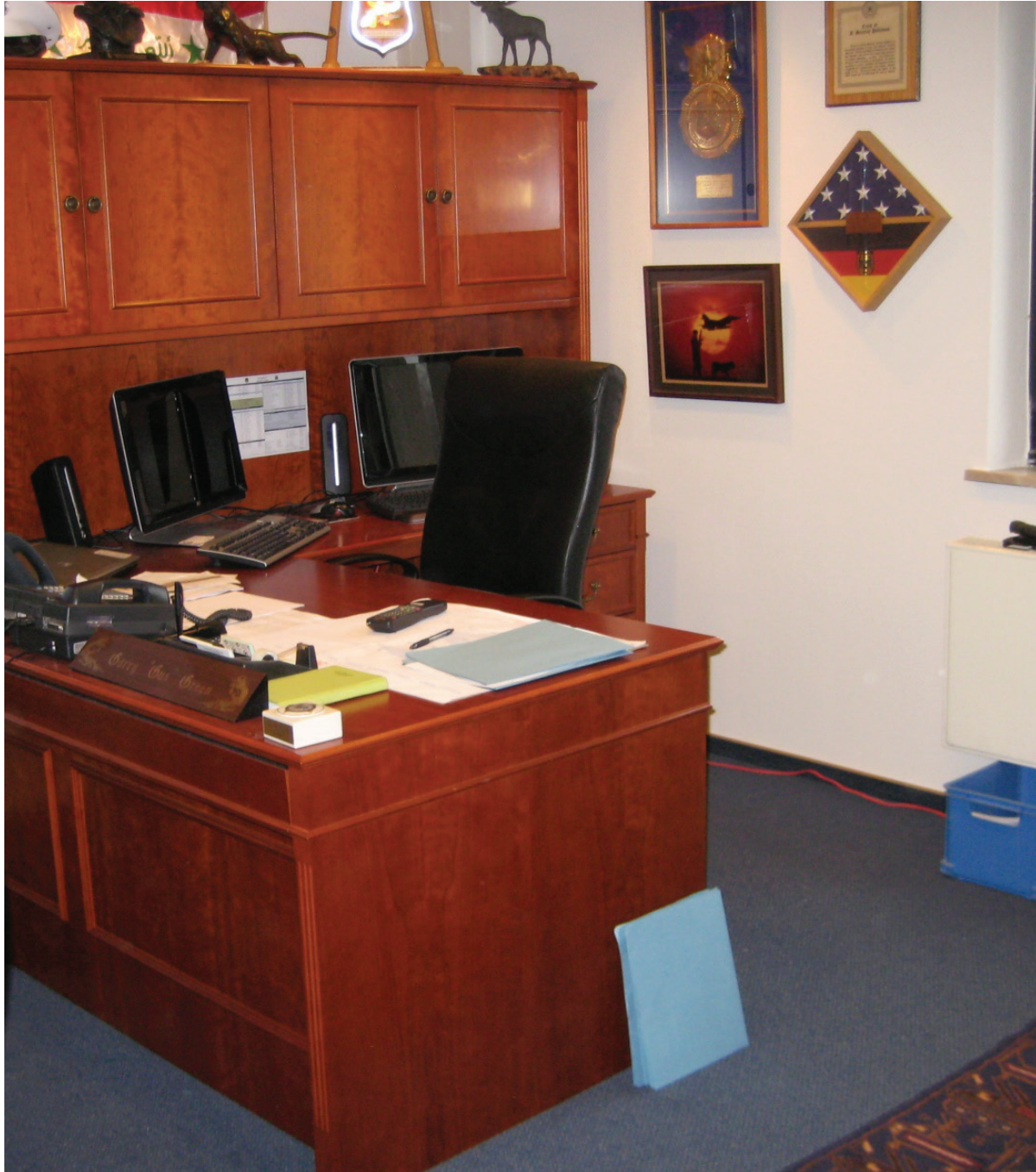
Executive Workstation, EXWS139 & EXOH213