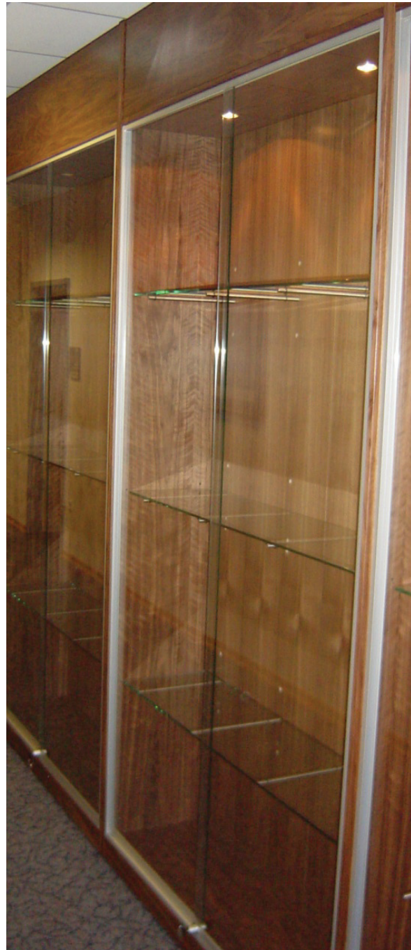
Left: High Executive custom made Trophycase with illumination Right: Custom made Trophycase with illumination, sliding doors