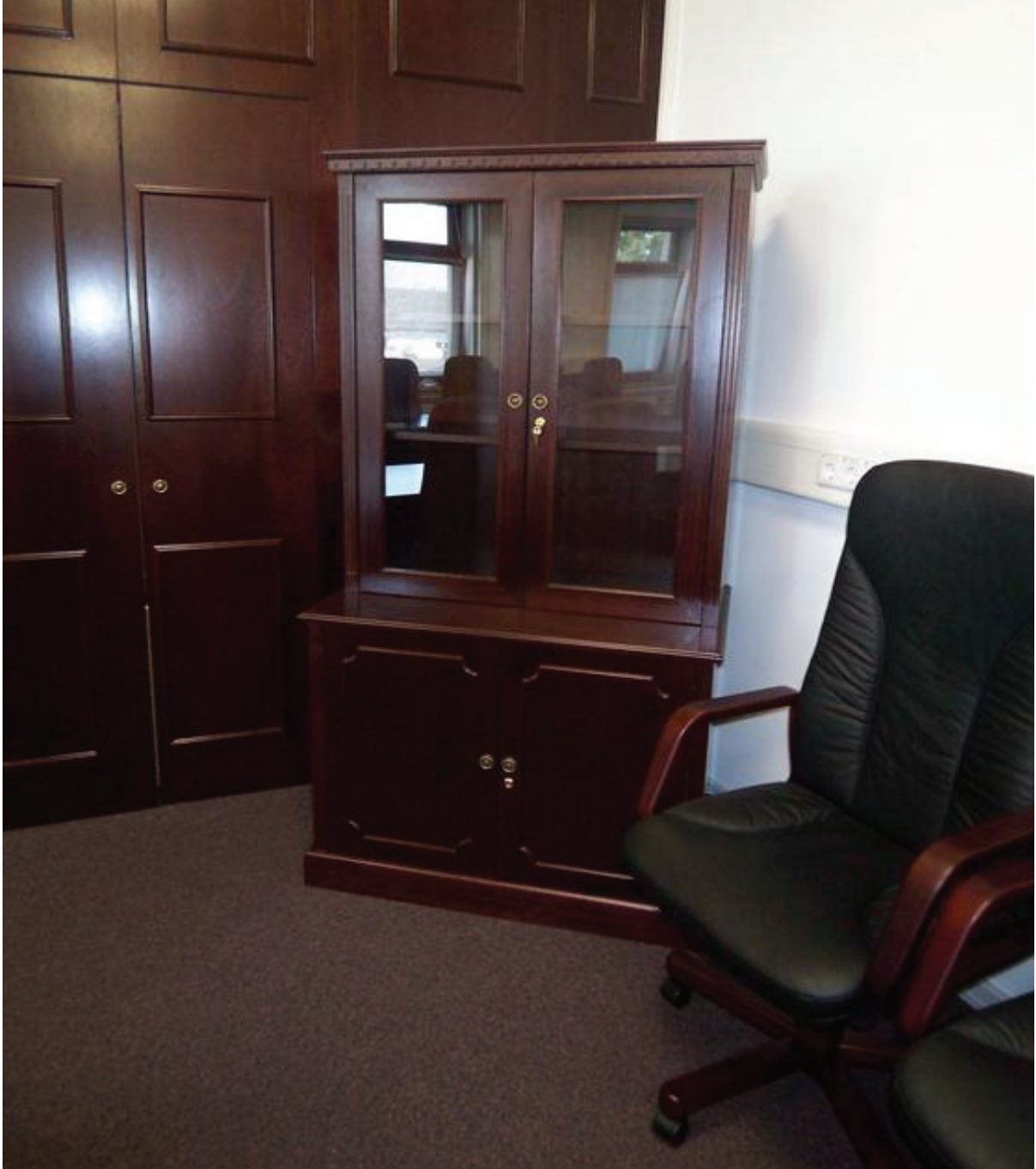
HEXCA615 & HEXES1123