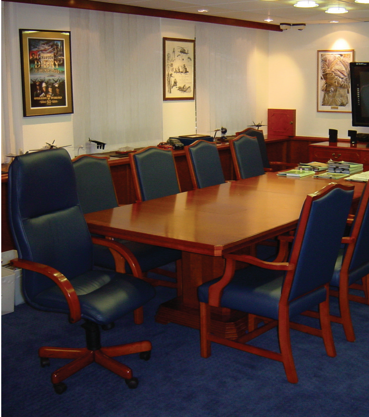
High Executive conference table with Sirius style high back chair and special made side chairs