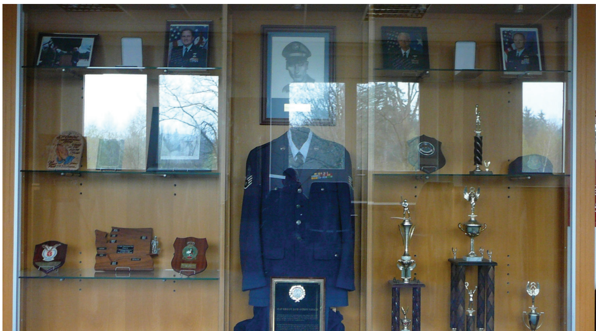
High Executive custom made Trophycase with sliding doors ,logo printed on mirror in the back and illumination Custom made Trophycase with illumination and sliding doors