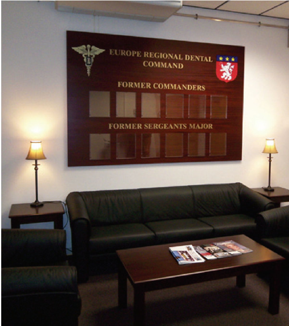
Custom made award boards