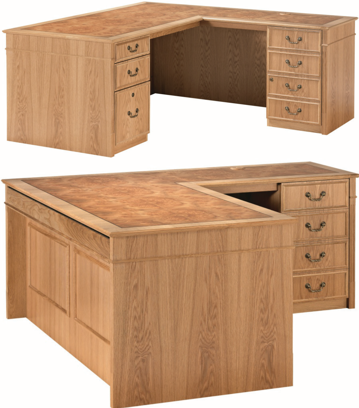
Executive Workstation with pedestals EXWS134, EXRS324, EXRS325