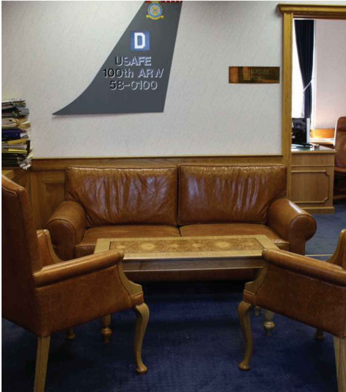
High Executive Lounge Area Elington style couch Regency style armchairs Coffeetable HEXCT533_sp, Victorian sytle