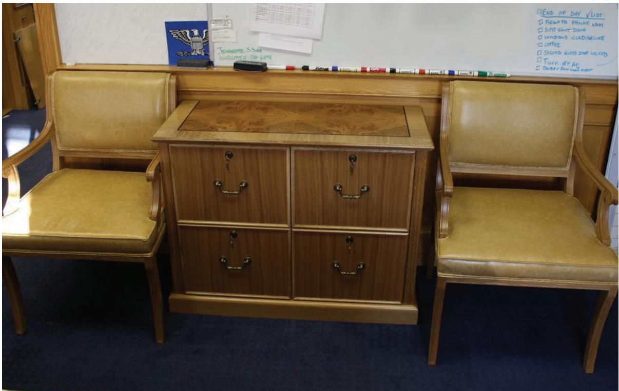
Executive Office Furniture, Hangingfile cabinet EXHF821, Newton style armchairs