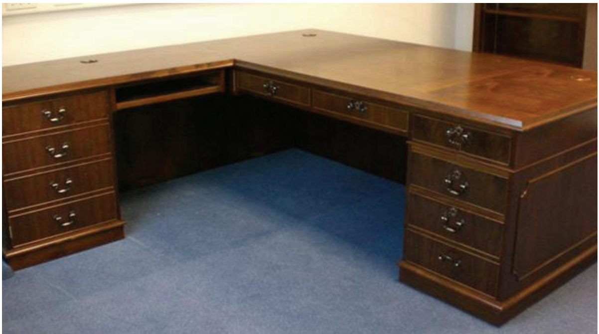
High Executive Workstation with pedestals, HEXWS136, HEXRS325, HEXRS326