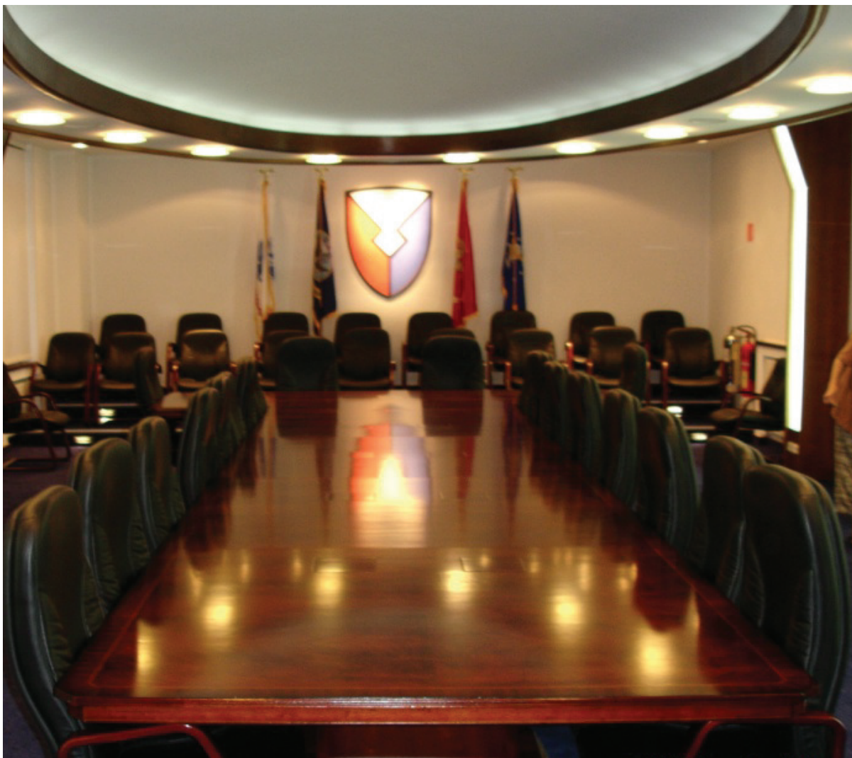
High Executive custom made conference room With desk, wall panels, technical equipment, illumination, chairs