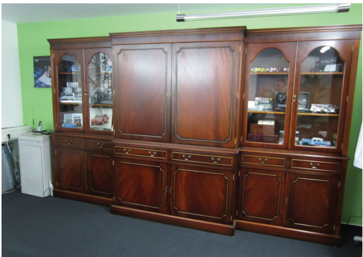
Custom made High Executive VTC cabinet With folding doors and prepared for technical equipment inside