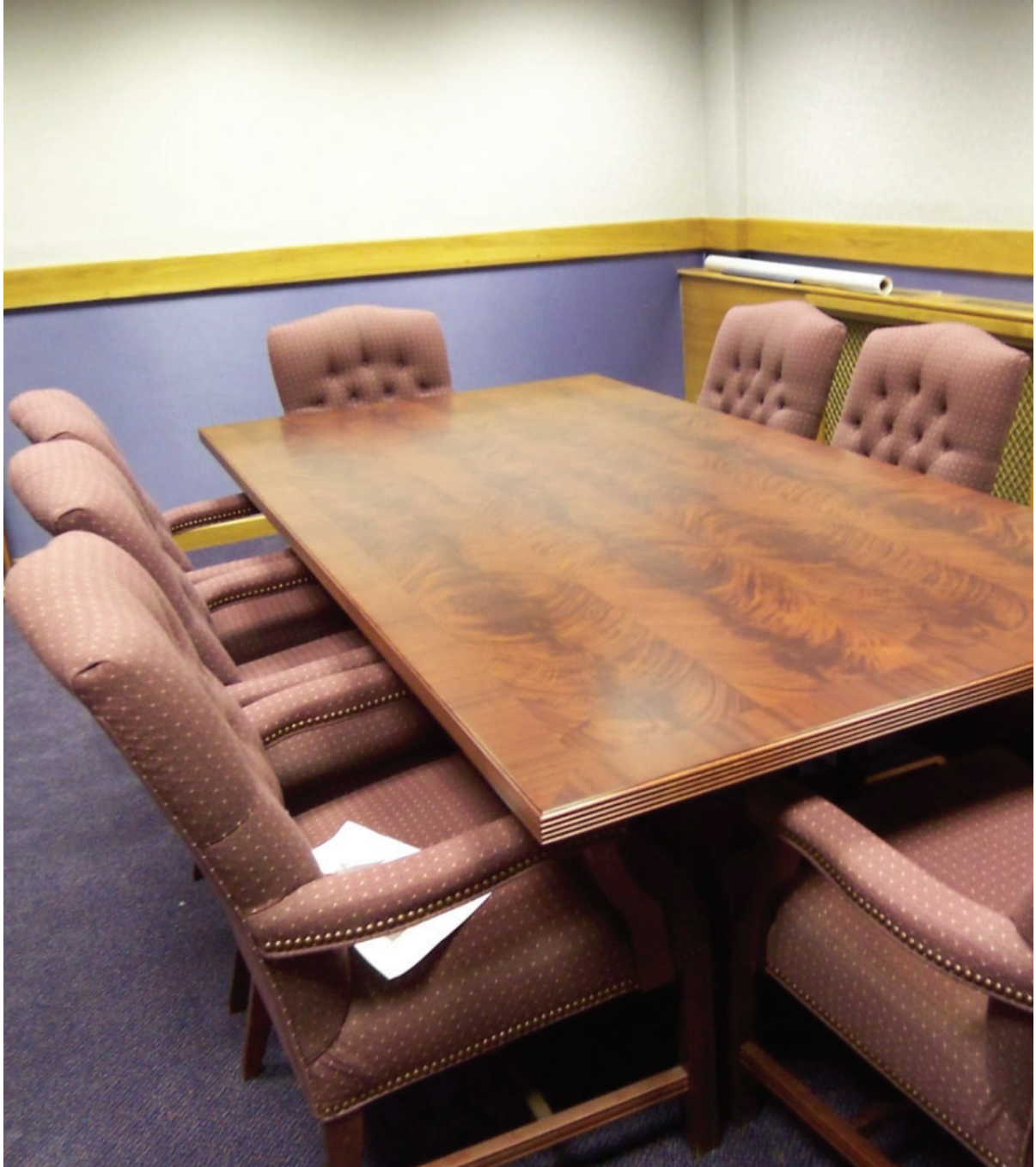
Executive conference desk with column base, EXCT515