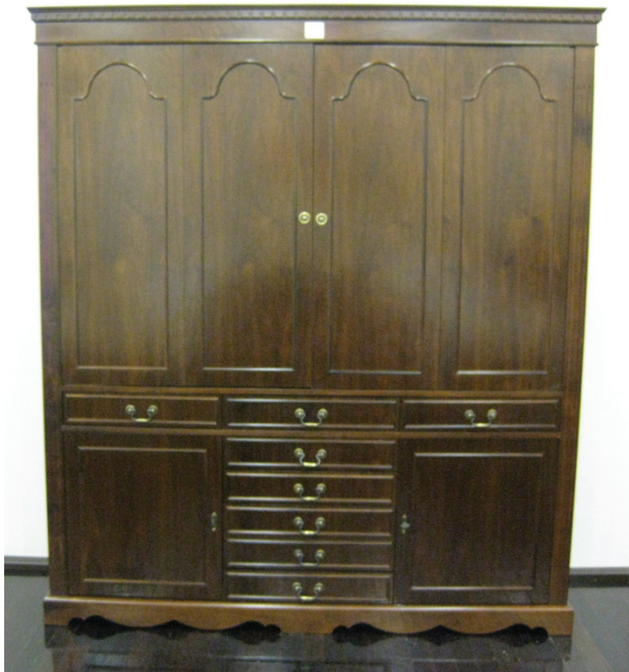
Custom made High Executive VTC cabinet With folding doors and prepared for technical equipment inside